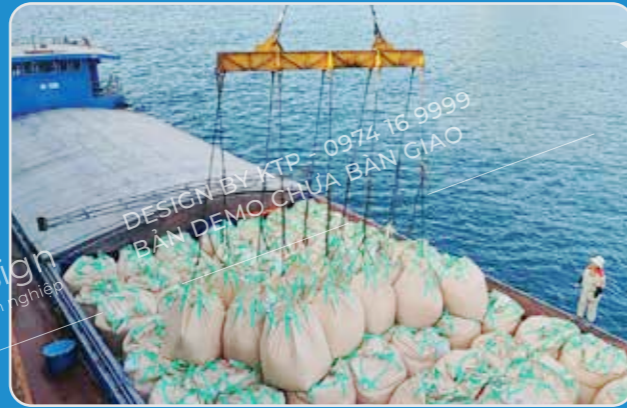
Loading bulk cement at Cam Pha anchorage, Vietnam