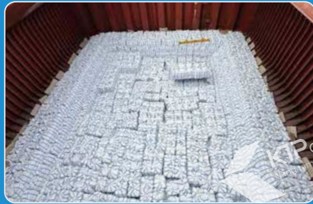
Cement in bag